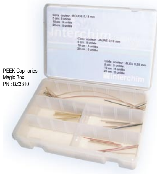
PEEK Capillaries Magic Box PN : BZ3310